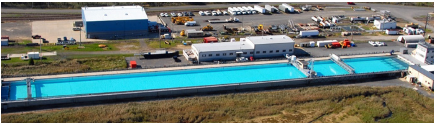
Image: Overhead view of Ohmsett For more information visit https://ohmsett.bsee.gov/

The Bureau of Safety and Environmental Enforcement, established in 2011, is a U.S. Department of the Interior agency. BSEE promotes worker safety, environmental protection and conservation of resources through regulatory oversight and enforcement of the offshore energy industry on the U.S. Outer Continental Shelf.